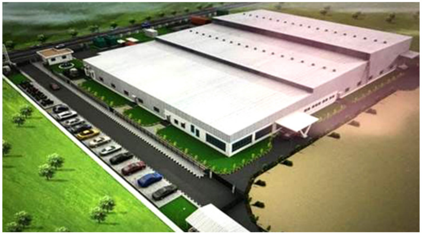
Aerial view of MIL – Lighting, Chennai

Oct'2018 – MIL Lighting Division has started production at Chennai plant. The Lighting Division has existing plants in Manesar & Pune for 4 Wheeler and plants in Bahadurgarh, Hosur, Pune and Sonipat for 2Wheeler.